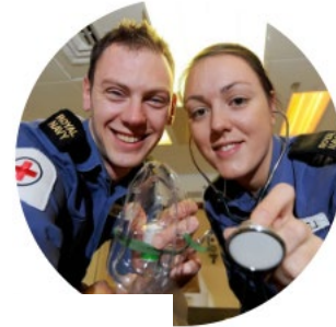
Nursing: Social Justice Communication

What are your ideas for your first semester courses? Your goal is to have 12-15 credits.