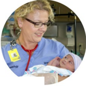
Nursing: Child Development

FIGs are clusters of (usually) three classes, linked together to explore a common theme, and open to incoming freshmen who attend these classes together as a group. The nursing specific FIGs are shown below (subject to change). There are also many additional FIGs to explore by visiting www.figs.wisc.edu .