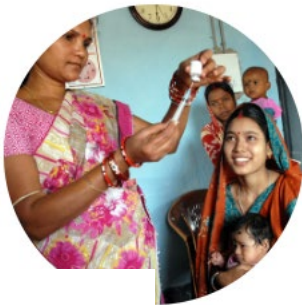
Nursing: Global Health