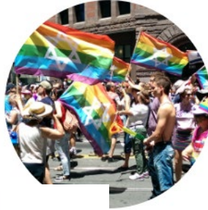
Nursing: Culturally Centered Care