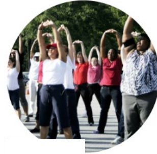
Nursing: Diversity and Women's Studies